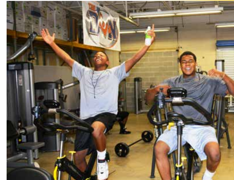
Teens in The DEN, YSOC's New Workout Facility

536 Individuals, Businesses, and Foundations Supported Our Mission through Financial Contributions