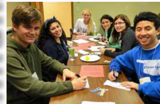
Teen Service Board Members Volunteering and Making a Difference!

With your help, we can CHANGE YOUNG LIVES!