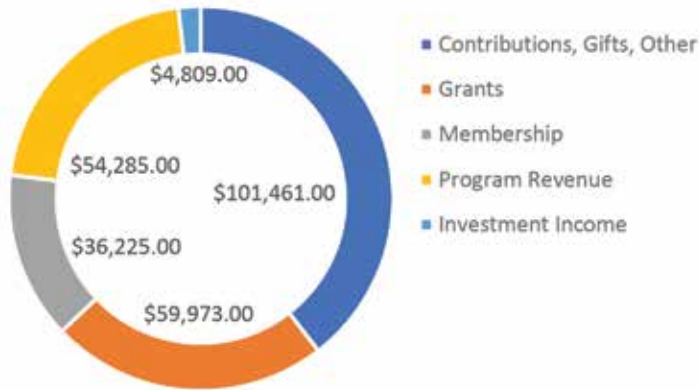
FY 2018 Revenue Sources